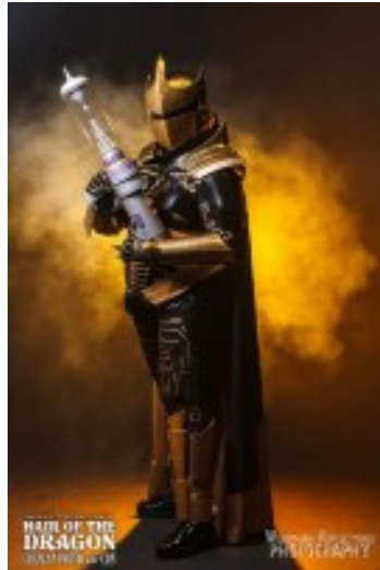
Royal Pain from "Sky High"