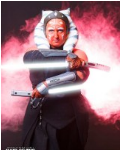
Ahsoka Tano from "The Mandalorian"