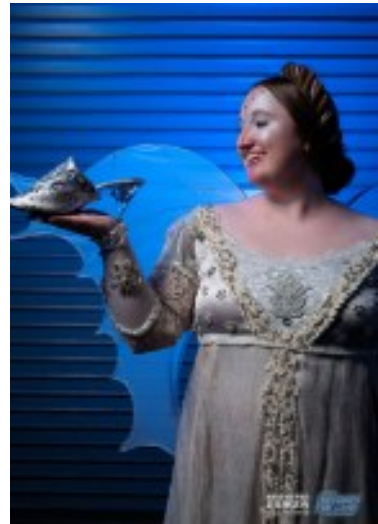
Danielle de Barbarac from "Ever After"

Cosplay to be displayed Princess Anneliese from Barbie: Princess and the Pauper