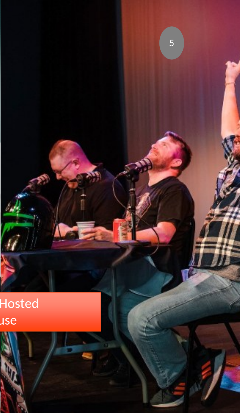
Entertain this Podcast! Hosted their panel for a full house