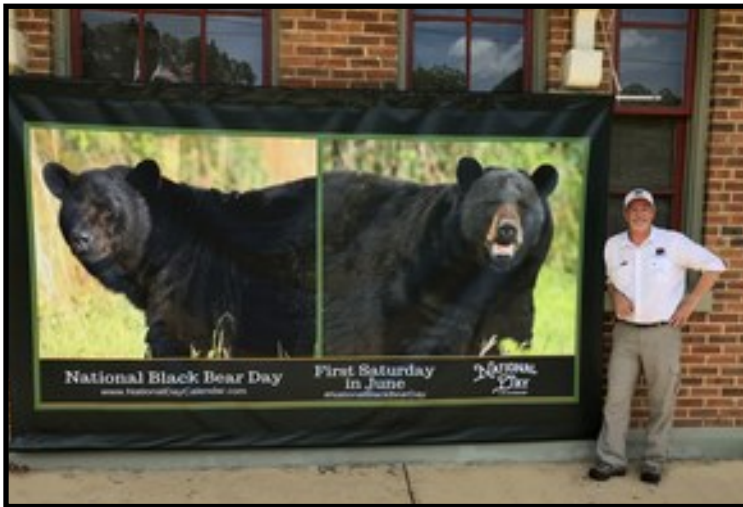
Tom was successful in creating a National Black Bear Day